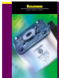
HIGH SPEED FUSES