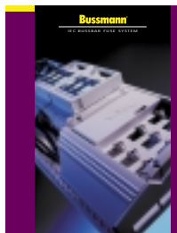
IEC BUSBAR FUSE SYSTEM