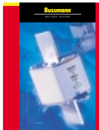
NH FUSE SYSTEM

Cooper Bussmann Cooper (UK) Limited Burton-on-the-Wolds Leicestershire - LE12 5TH UK Telephone: 44 (0)1509 882 737 Facsimile : 44 (0)1509 882 786 http://www.bussmann.com