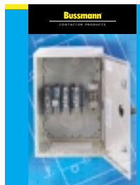
LOW VOLTAGE FUSEGEAR