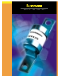
LOW VOLTAGE FUSE LINKS